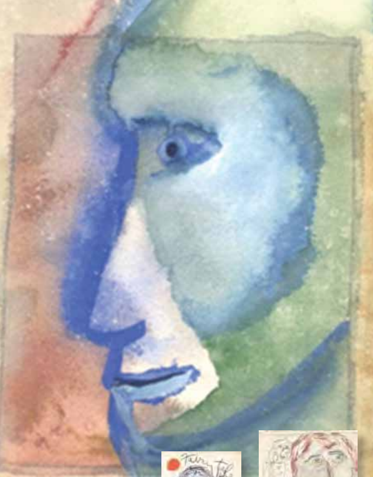
Watercolours by Henry Miller